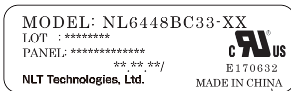
Name plate Label